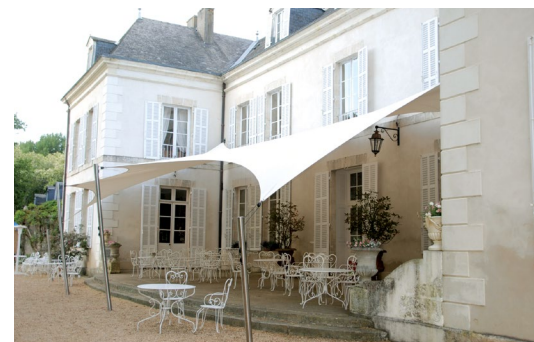
WeatherMAX 80 Oyster is shown here in a hotel setting.