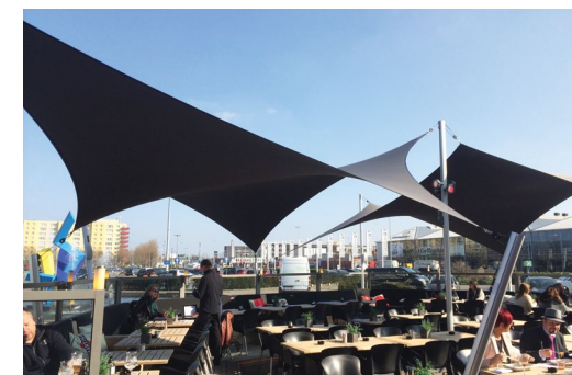
A restaurant setting utilizes WeatherMAX 80 Slate.