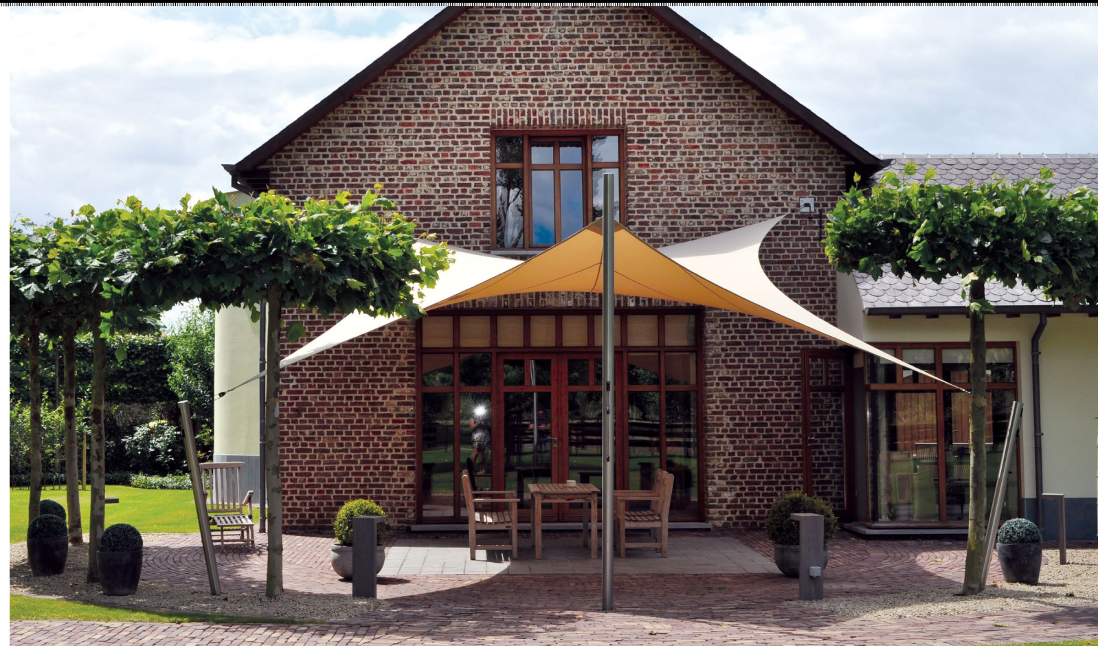
WeatherMAX 80 Beige is featured in this residential application.