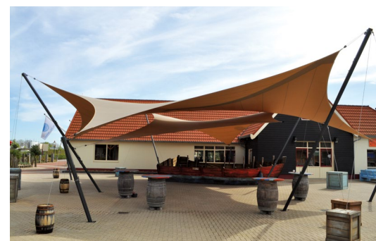
An amusement park location illustrates a great use of WeatherMAX 80 Sandstone.