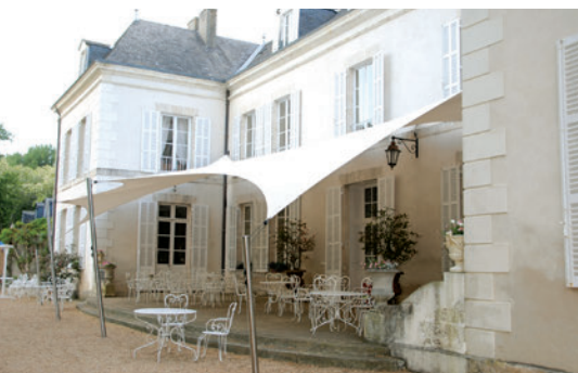
WeatherMAX® 80 Oyster is shown here in a hotel setting.