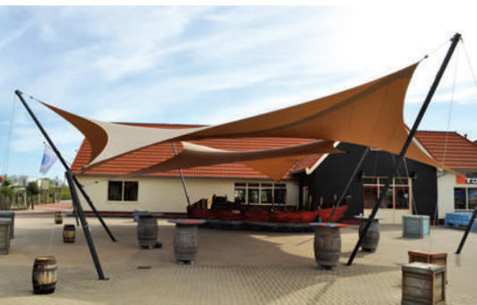
An amusement park location illustrates a great use of WeatherMAX® 80 Sandstone.