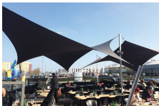
A restaurant setting utilizes WeatherMAX® 80 Slate.